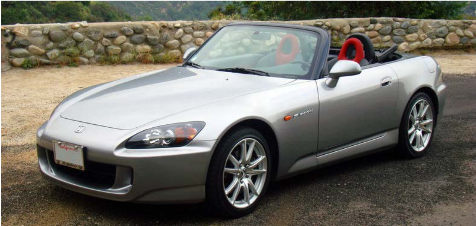
A 2000-2005 Honda S2000