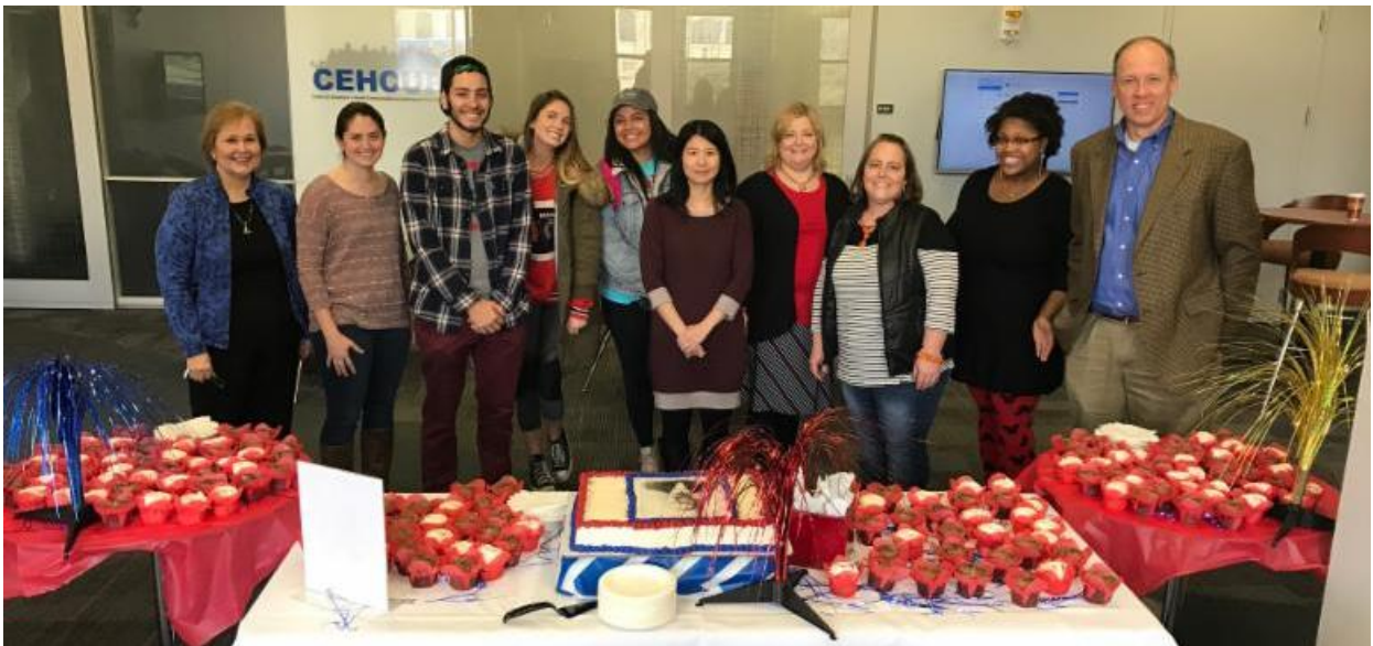
A quick photo before the cake cutting for William Allen White's 149th birthday last Friday.